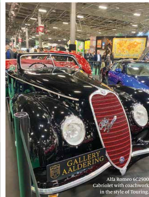
Alfa Romeo 6C2500 Cabriolet with coachwork in the style of Touring.