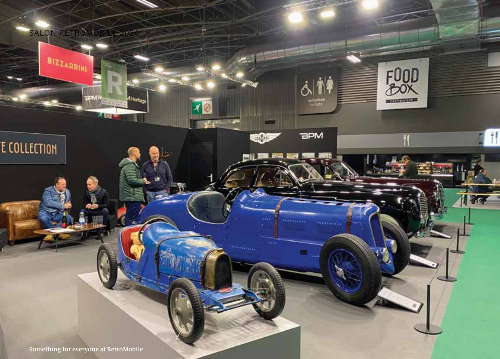
Something for everyone at RetroMobile