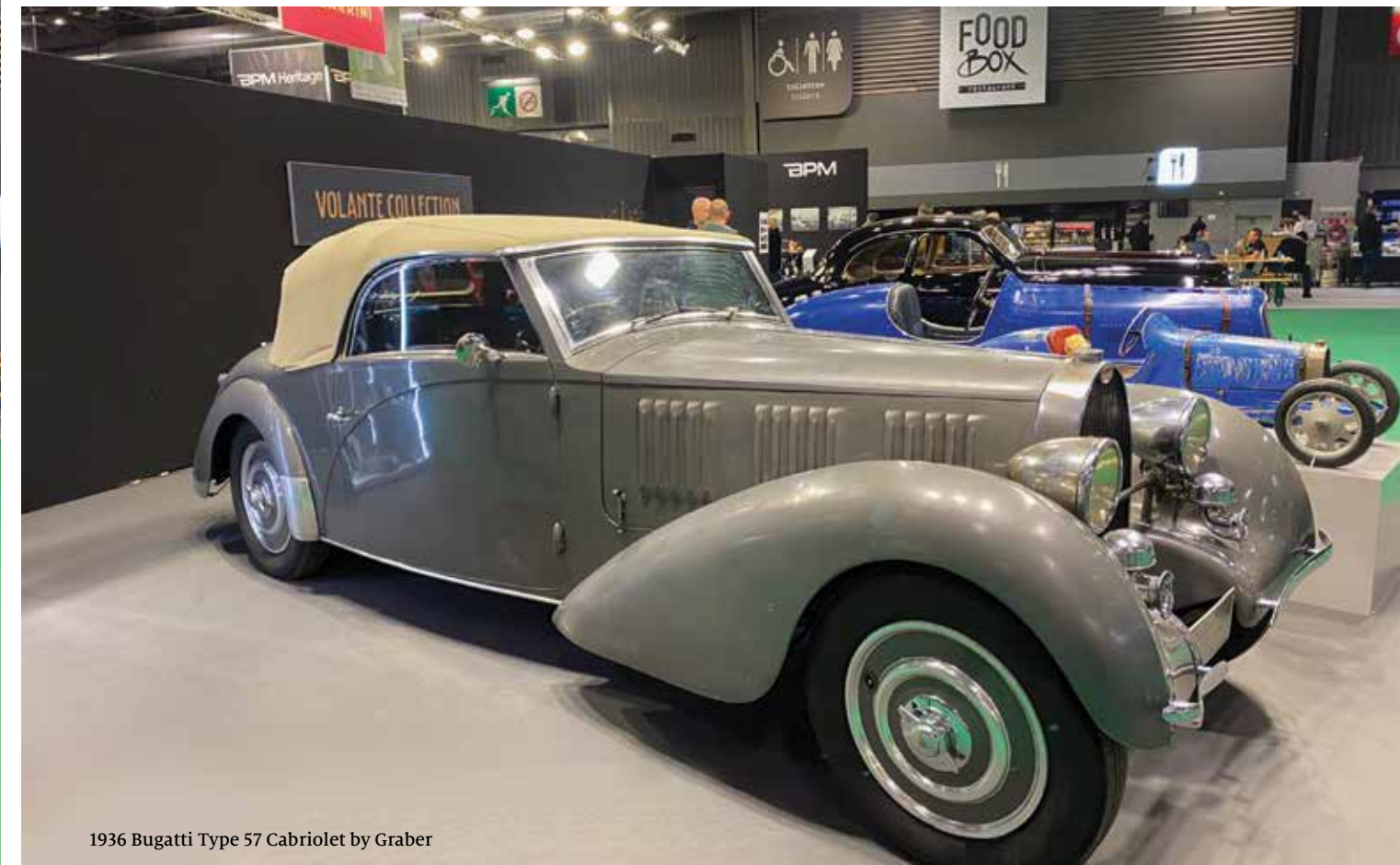
1936 Bugatti Type 57 Cabriolet by Graber