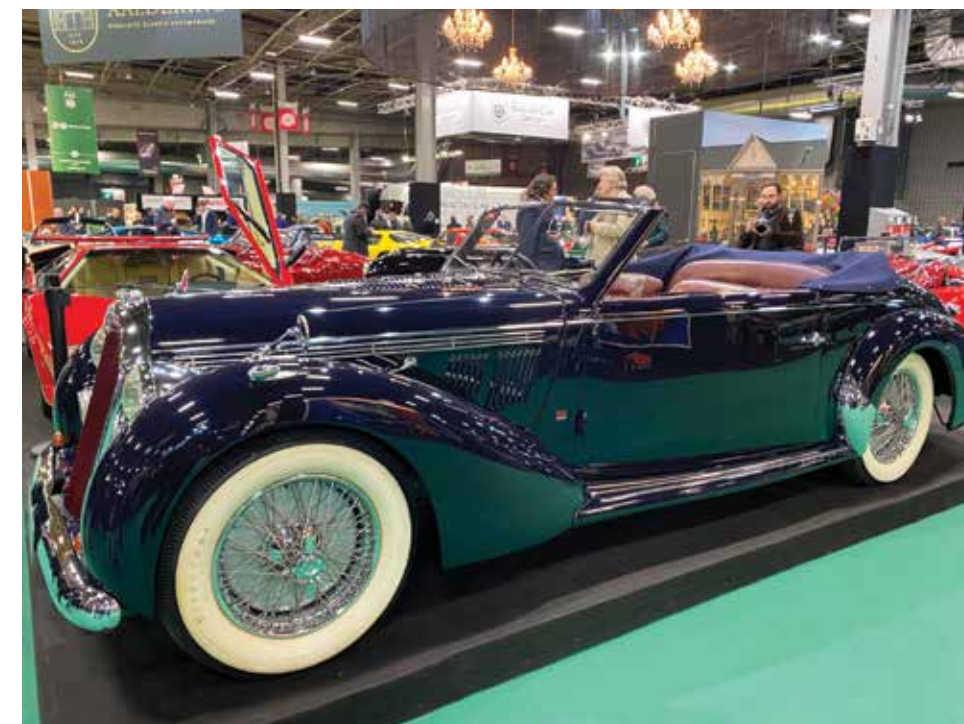
Photos clockwise from top left: 1929 Bugatti Type 44; 1947 Talbot-Lago T26 Record Cabriolet by Worblaufen; A Lancia Lambda, one of the most innovative cars of its time; Bugatti Type 57 Atlantic, chassis 57473.

we ventured to India where I judged the 21 Gun Salute Salute and shared that experience in the Side Mount Mirror .