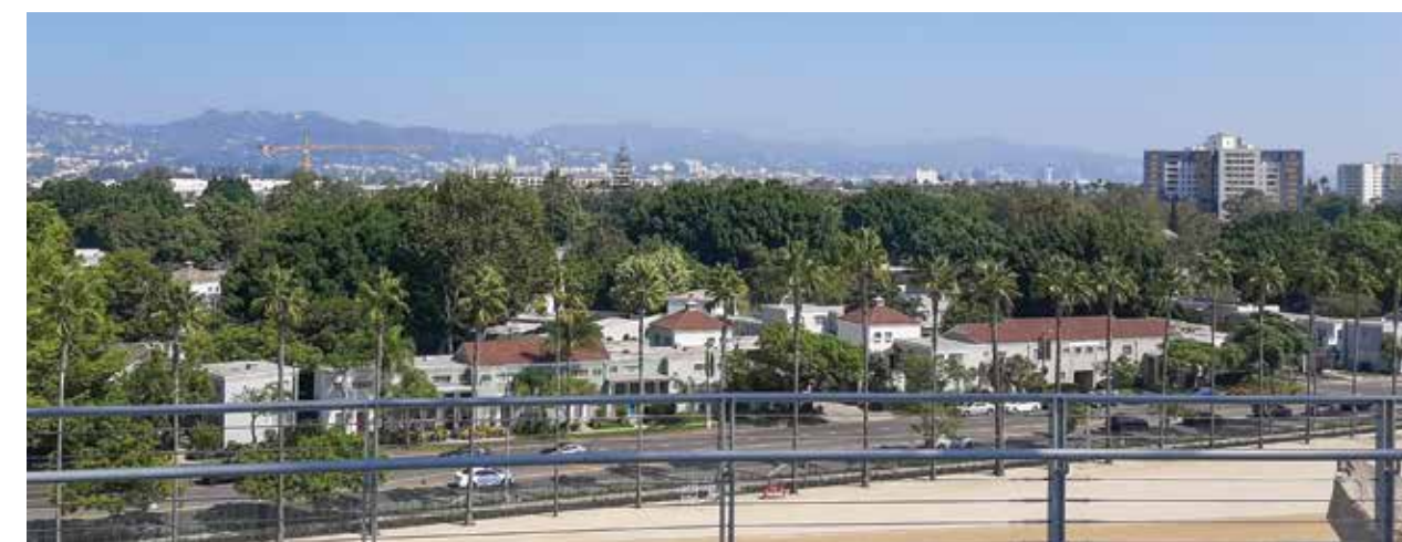
Photos clockwise from left: Talent considerations for The Graduate ; The art of costume design; Fanny's Restaurant at the Academy Museum; view of the Hollywood Hills from the Sphere Plaza; one of the sharks from Jaws .

The five levels of the Museum provide an in-depth look at all aspect of filmmaking: acting, animation, casting, cinematography, costume design, directing, editing, executives, makeup & hairstyling, marketing & public relations, music, producing, production design, screenwriting, sound and visual & special effects. Large exhibits explore these filmmaking components, supplemented with memorabilia providing a glimpse into the behind-the-scenes aspects of motion pictures.