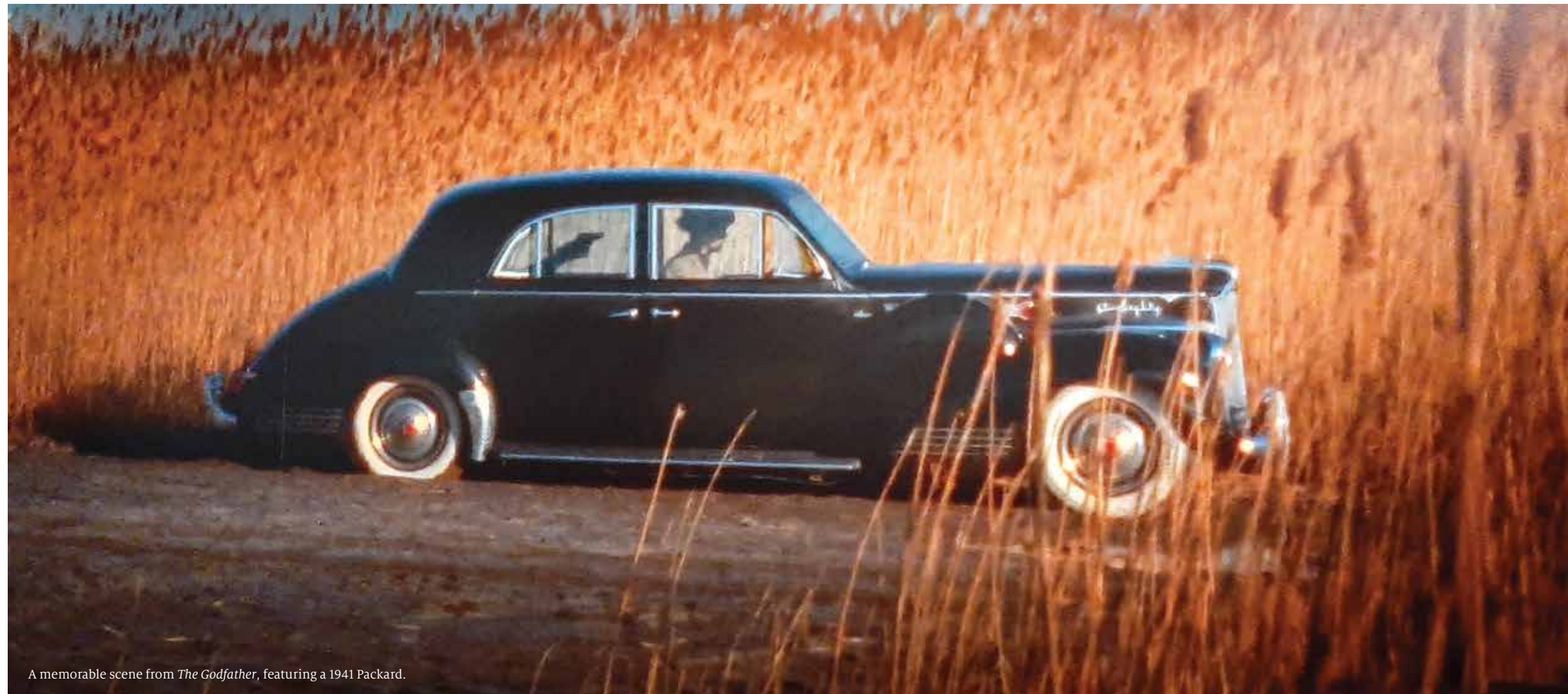
A memorable scene from The Godfather , featuring a 1941 Packard.

About 25 Southern California Region members toured the Academy Museum on Saturday, September 27, learning all there is to know about the art and science of filmmaking. The Academy Museum opened in September 2021, housed in renovated Art Deco building at the corner of Wilshire and Fairfax on museum row. Originally the flagship May Company department store location, it was built in 1939 and was, and still is, instantly recognizable by the prominent cylindrical façade adorned with gold tile. The nearly $400 million renovation included the addition of a second structure, a huge sphere that houses a 1,000-seat theater and an open-air terrace with unobstructed views of the Hollywood hills. >