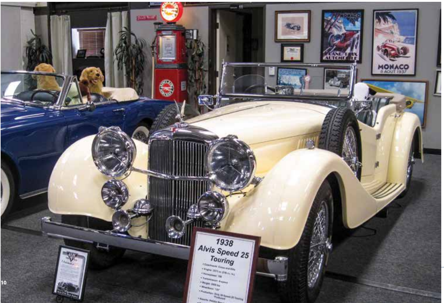
1938 Alvis Speed 25 Touring