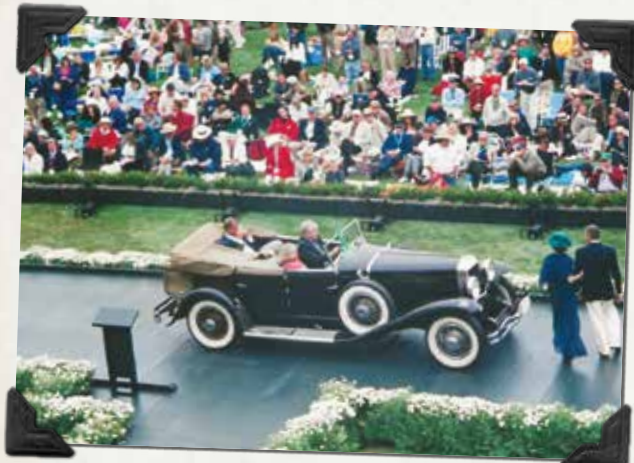
1929 Duesenberg J Convertible Sedan by Murphy, a Preservation entry, 2001