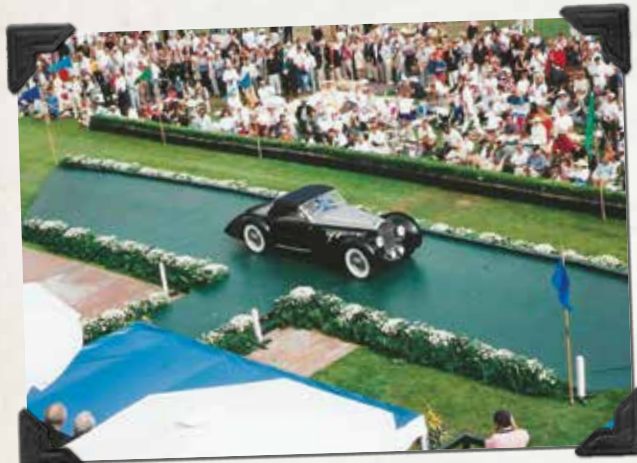
1938 Delage D8-120-de Villars Speedster, Best of Show, 1996