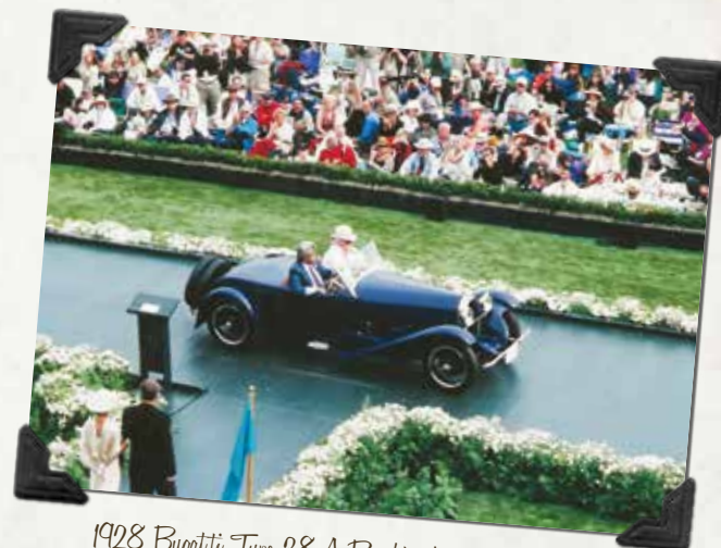
1928 Bugatti Type 38A Roadster by Murphy, 2002