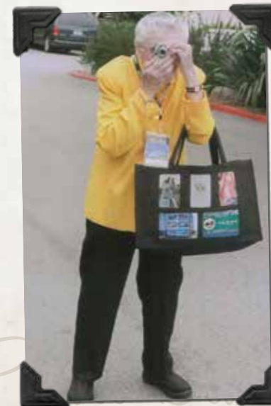
Bobbie'dine at Pebble Beach