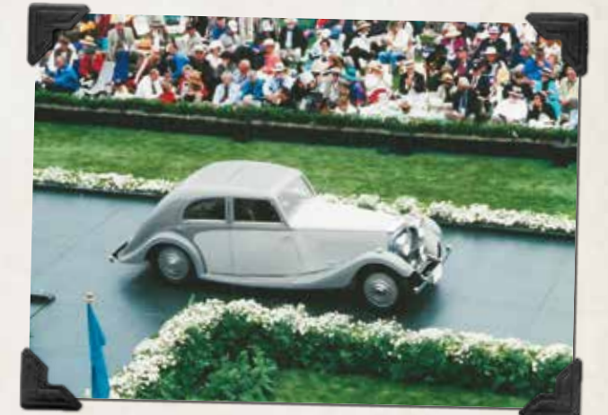
1935 Bentley 3.5-Litre Aerodynamic Saloon by Rippon Brothers, 2003