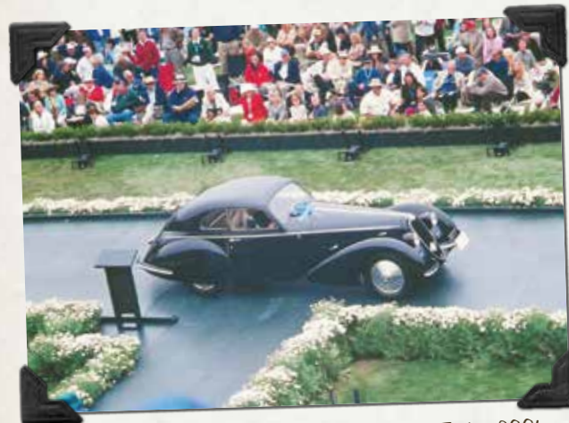
1937 Alfa Romeo 8C 2900B Berlinetta by Touring, 2001