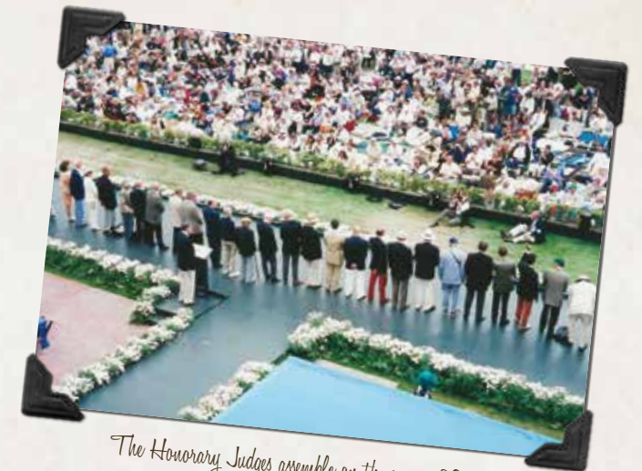
The Honorary Judges assemble on the ramp, 2000