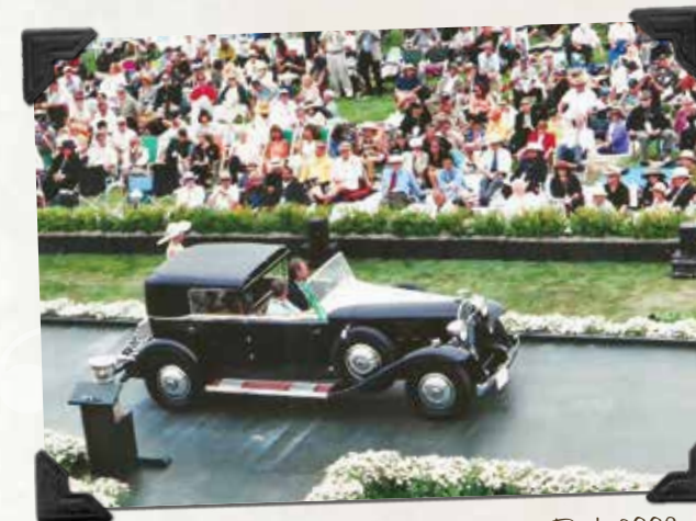
1932 Buick 90 Town Car by Murphy, the Seabiscuit Buick, 2003