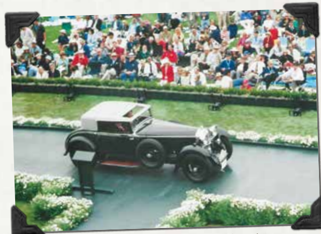
1930 Bentley Speed Six Weymann Coupe by Gurney Nutting, CCA Trophy, 2001