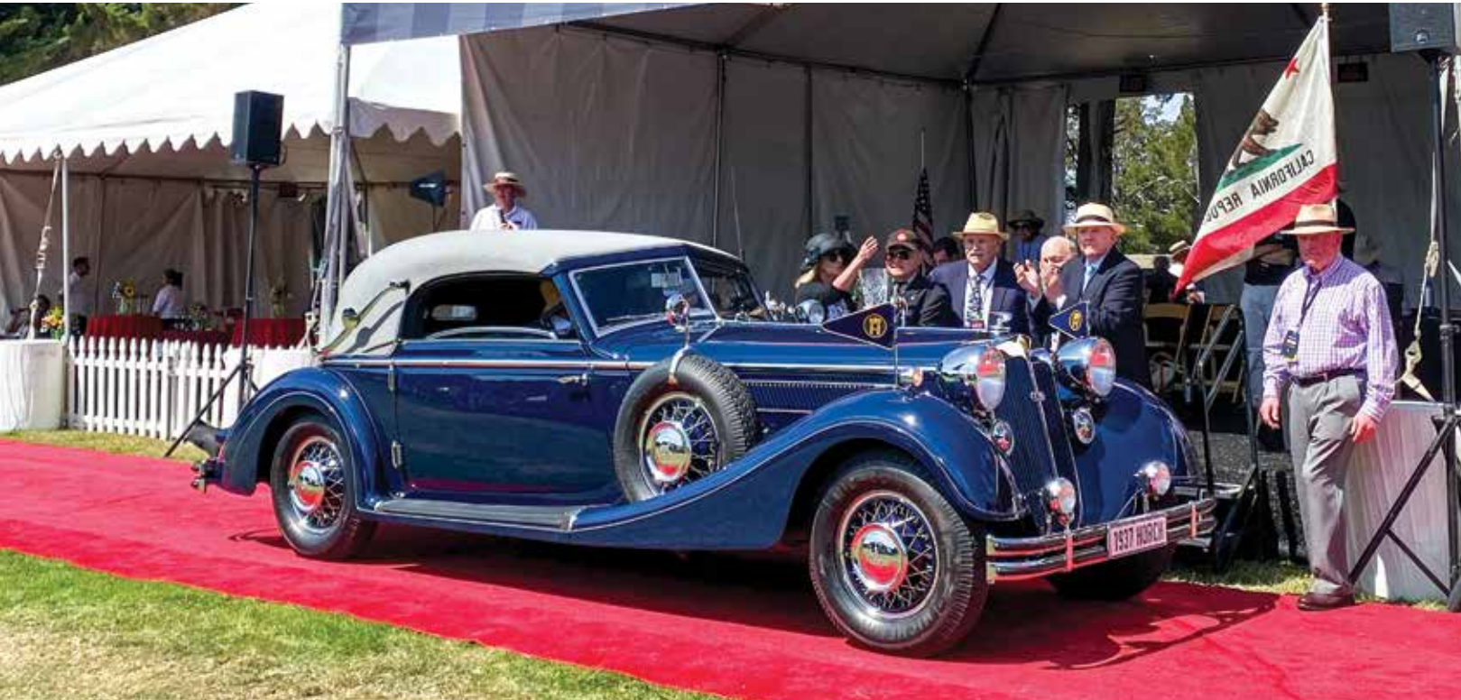
Best of Show, the Weiss' 1937 Horche 853 Glaser Cabriolet