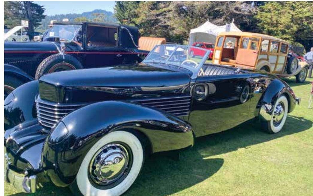
Allan McCrary's 1936 Cord 810 Cabriolet