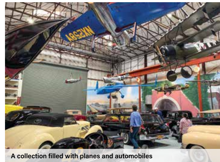
A collection filled with planes and automobiles