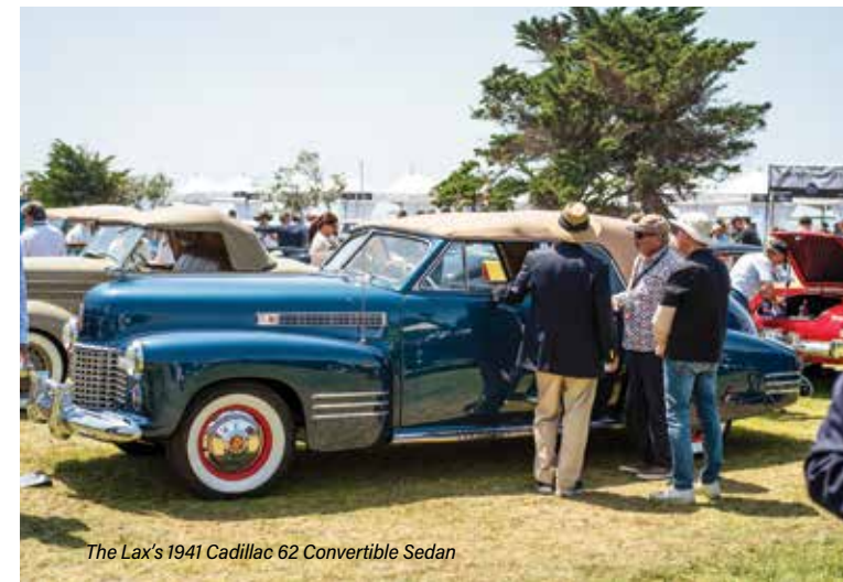
The Lax's 1941 Cadillac 62 Convertible Sedan