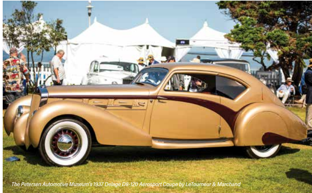
The Petersen Automotive Museum's 1937 Delage D8-120 Aerosport Coupe by LeTourneur & Marchand