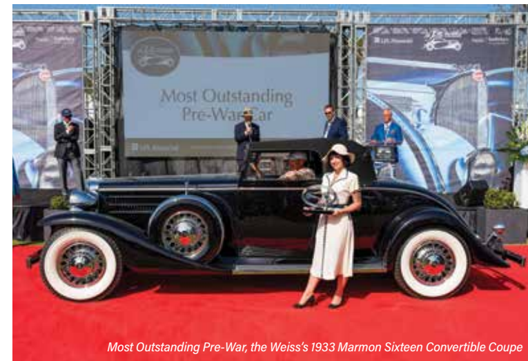
Most Outstanding Pre-War, the Weiss's 1933 Marmon Sixteen Convertible Coupe