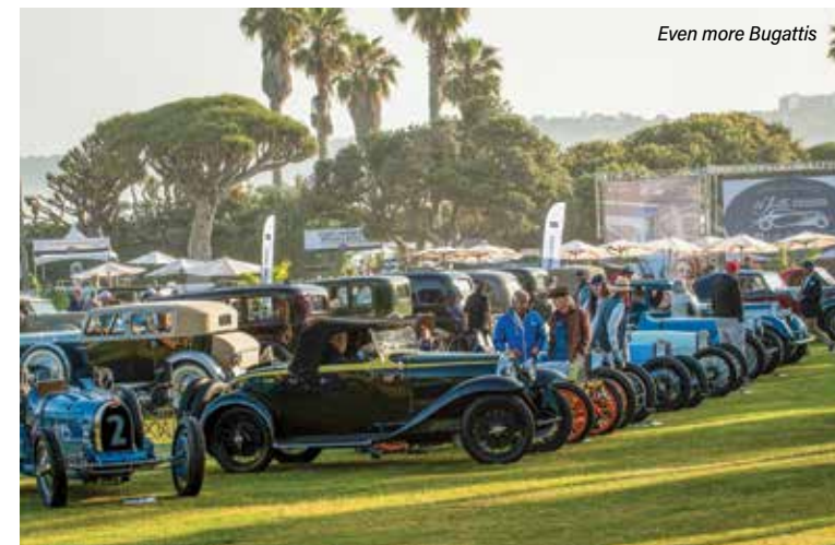
Even more Bugattis