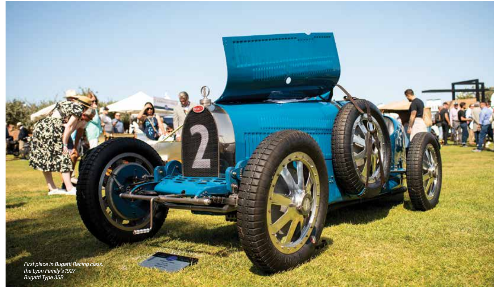
First place in Bugatti Racing class, the Lyon Family's 1927 Bugatti Type 35B