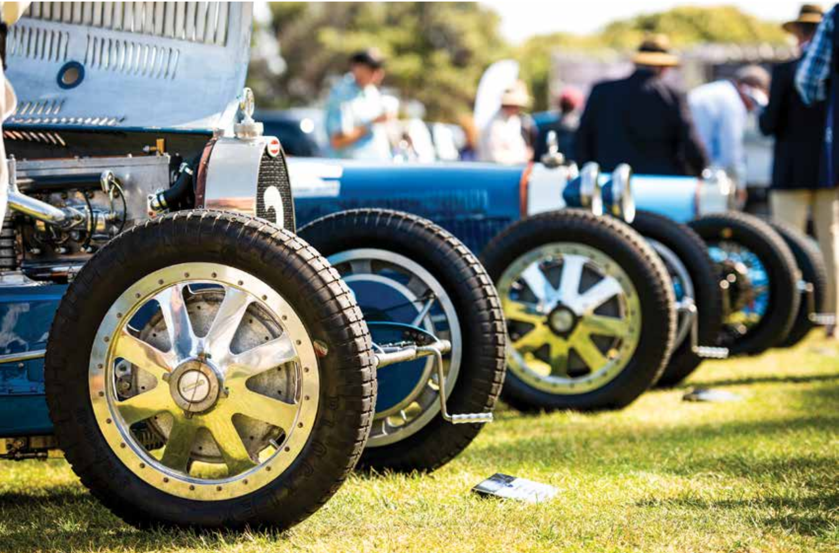
An impressive display of the feature marque Bugatti