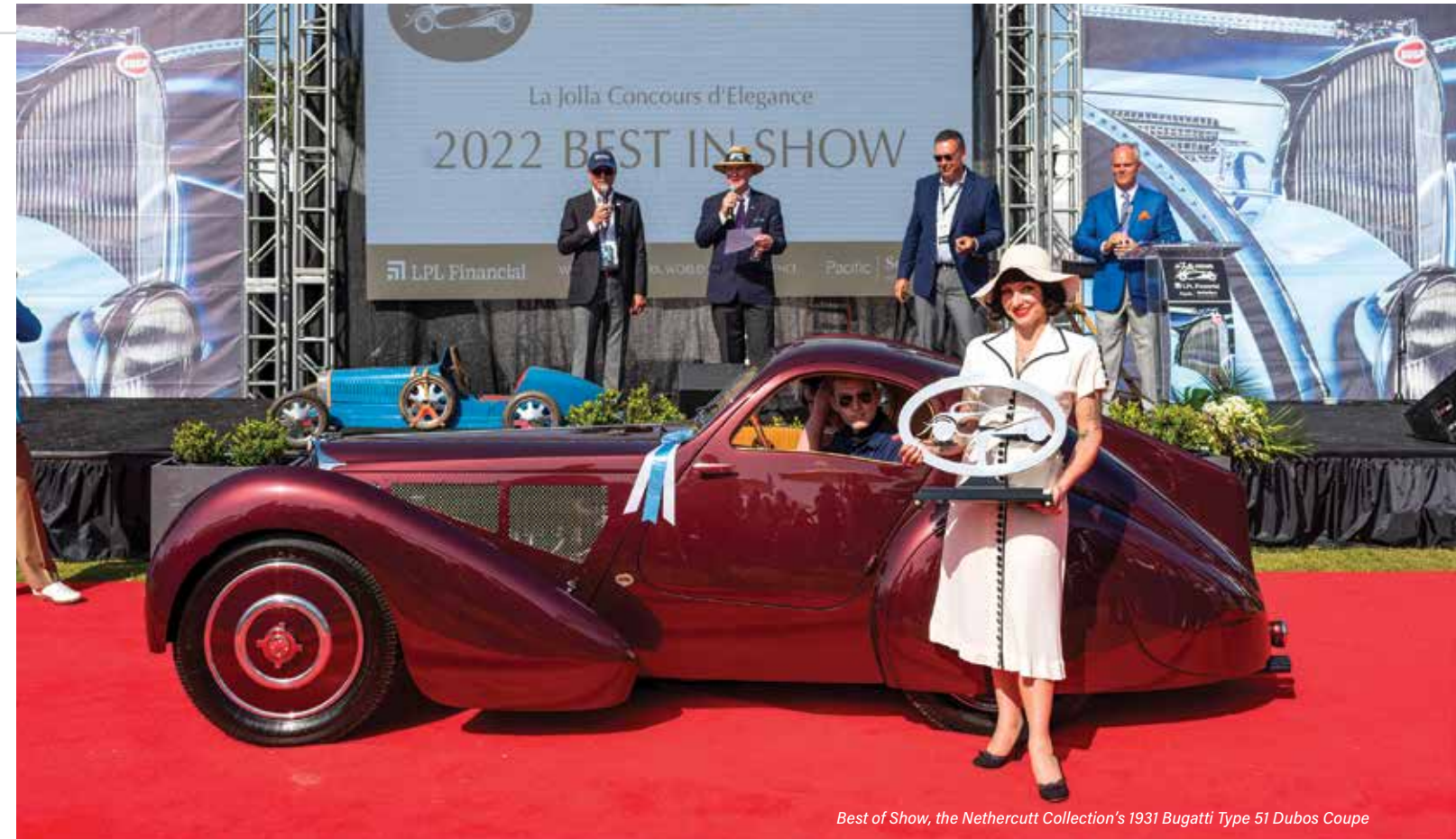
Best of Show, the Nethercutt Collection's 1931 Bugatti Type 51 Dubos Coupe