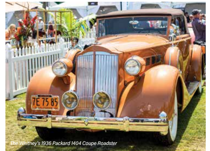
The Whitney's 1936 Packard 1404 Coupe Roadster