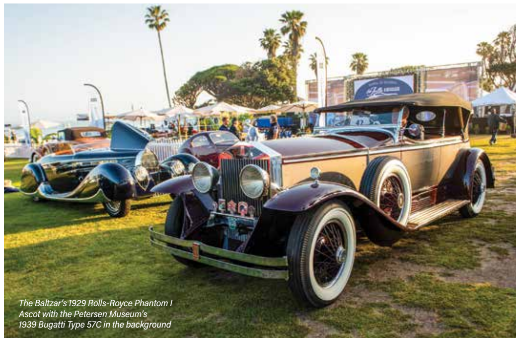
The Baltzar's 1929 Rolls-Royce Phantom I Ascot with the Petersen Museum's 1939 Bugatti Type 57C in the background