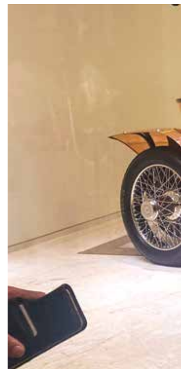
Photos from top: The Wynn Las Vegas served as the location for the Las Vegas Concours d'Elegance; 1921 Rolls-Royce Silver Ghost Brockman Speedster, the National Automobile Museum.