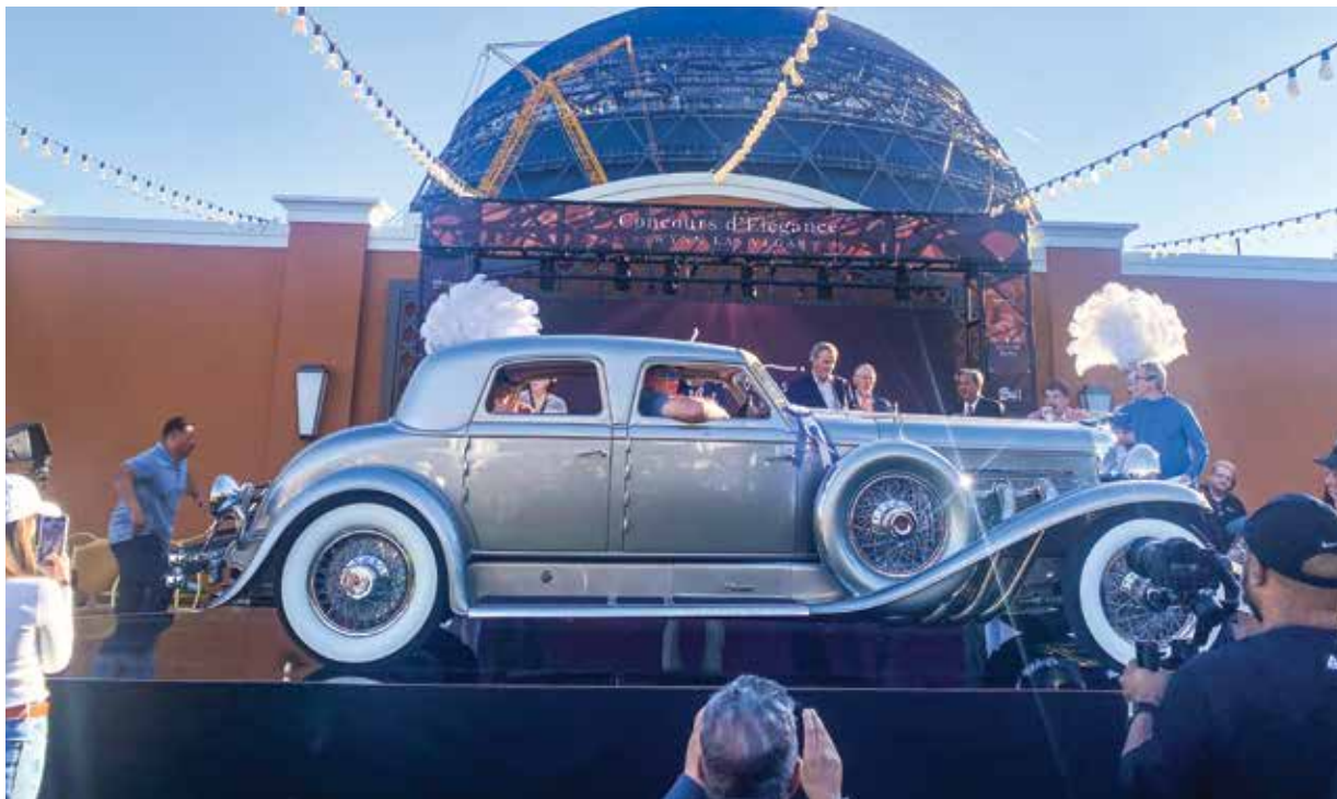
Photos this page from top: The Petersen Automotive Museum's 1929 duPont Model G Speedster by Merrimac; Best of Show Prewar, The Nethercutt Duesenberg.