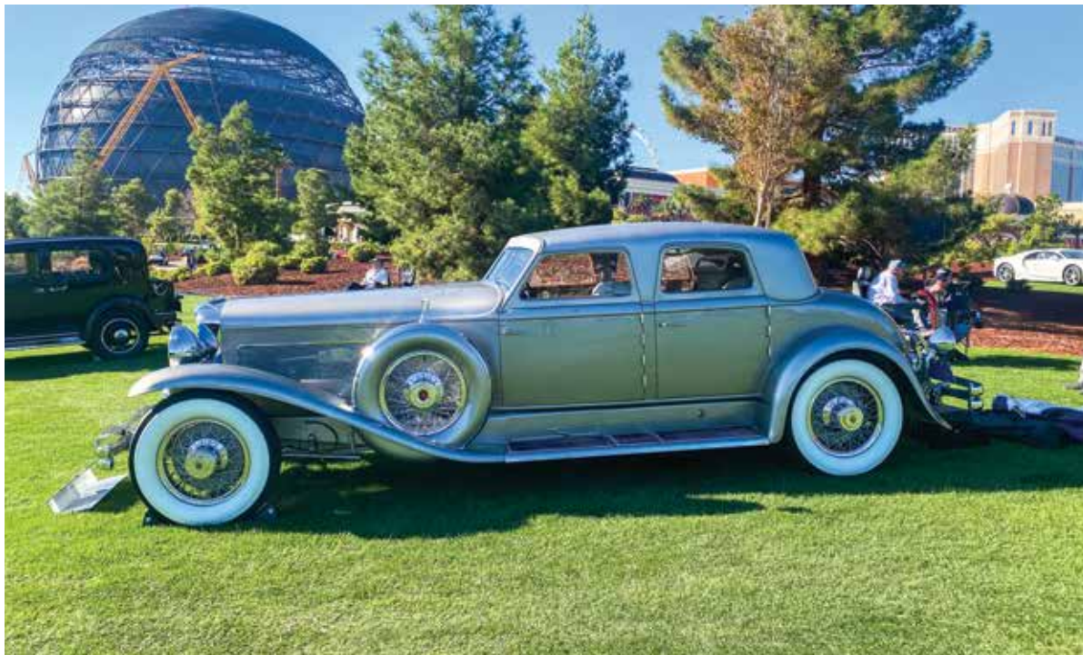
Photos clockwise from top left: Opening Night Gala at the XS Nightclub at The Wynn Hotel; The expansive show field with the Las Vegas skyline in the background; 1933 Duesenberg Model SJ Rollston Torpedo Sedan, The Nethercutt Collection; 1933 Duesenberg Model J Convertible Coupe by Murphy, The Petersen Automotive Museum.