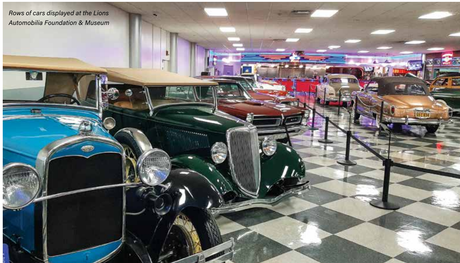
Rows of cars displayed at the Lions Automobilia Foundation & Museum