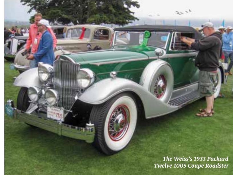
The Weiss's 1933 Packard Twelve 1005 Coupe Roadster