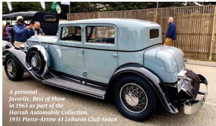
A personal favorite, Best of Show in 1963 as part of the Harrah Automobile Collection, 1931 Pierce-Arrow 41 LeBaron Club Sedan