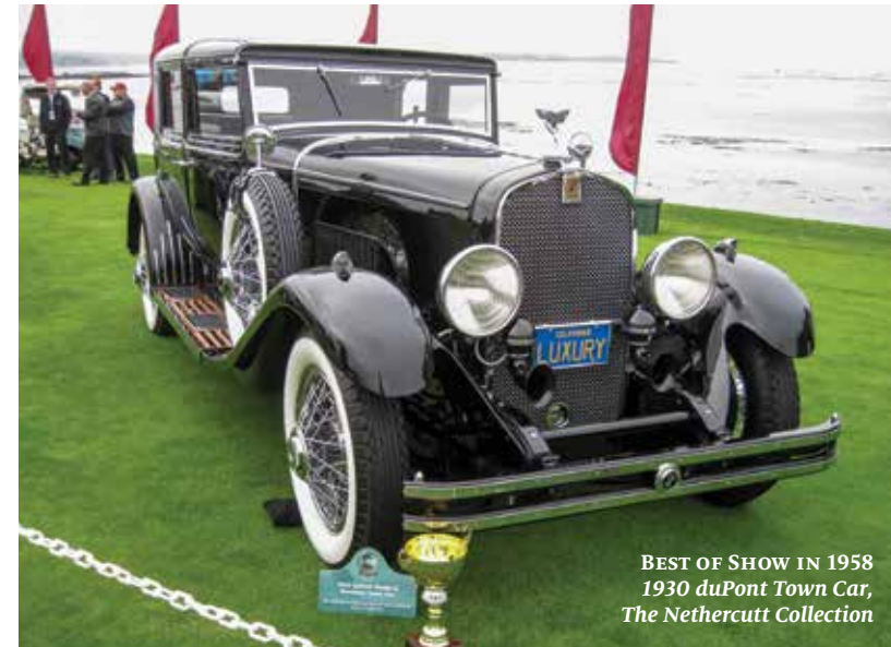
BEST OF SHOW IN 1958 1930 duPont Town Car, The Nethercutt Collection