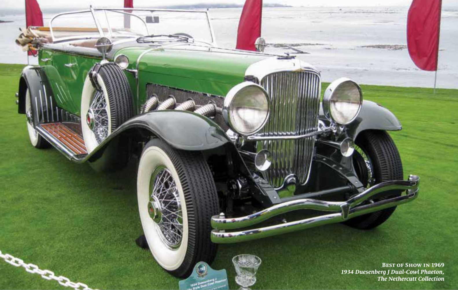
BEST OF SHOW IN 1969 1934 Duesenberg J Dual-Cowl Phaeton, The Nethercutt Collection