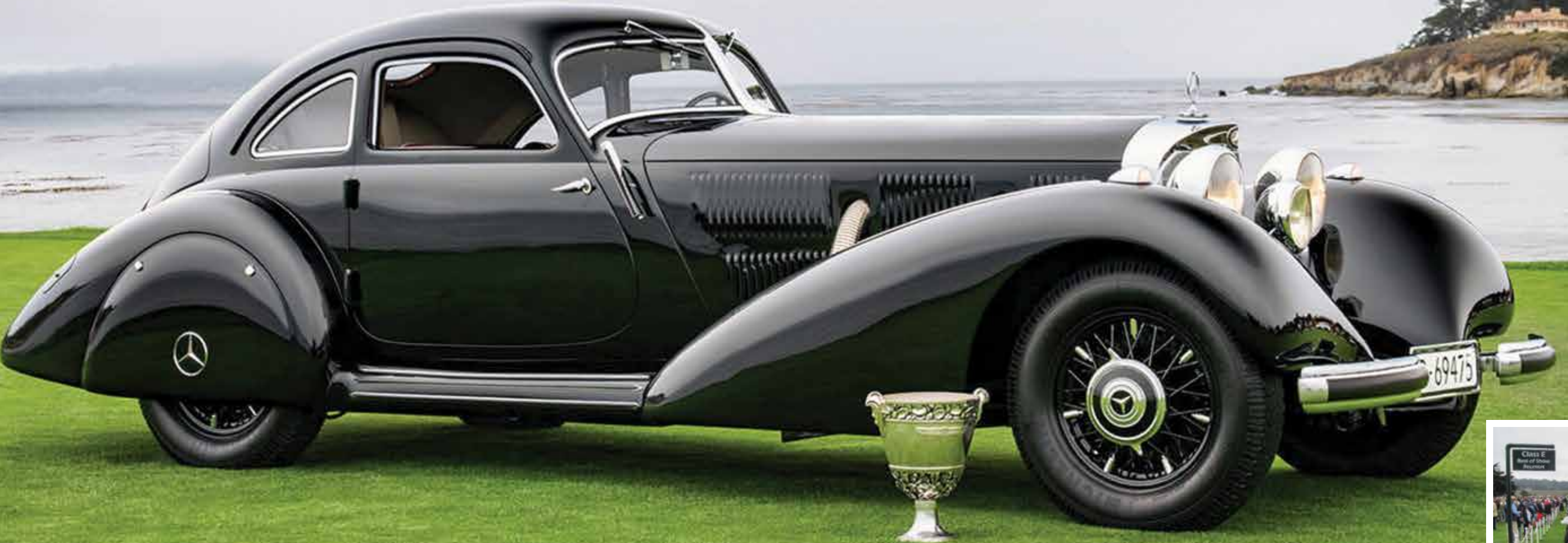
BEST OF SHOW 1938 Mercedes-Benz 540k Autobahn Kurier