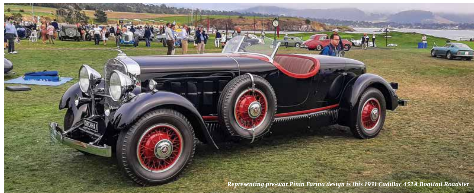
Representing pre-war Pinin Farina design is this 1931 Cadillac 452A Boattail Roadster