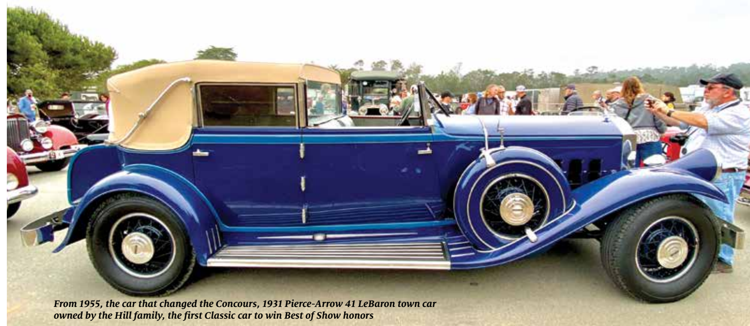
From 1955, the car that changed the Concours, 1931 Pierce-Arrow 41 LeBaron town car owned by the Hill family, the first Classic car to win Best of Show honors