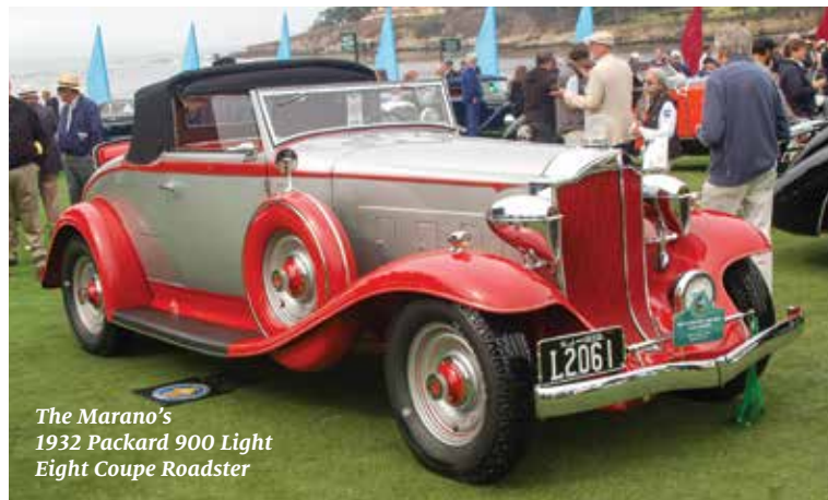
The Marano's 1932 Packard 900 Light Eight Coupe Roadster