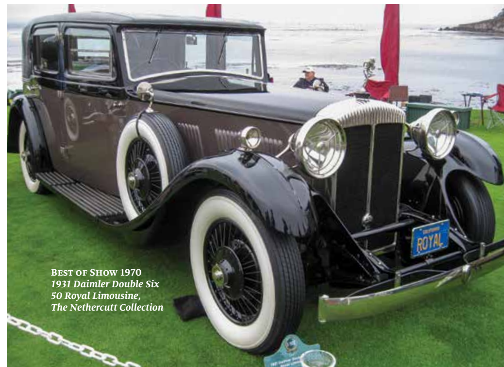
BEST OF SHOW 1970 1931 Daimler Double Six 50 Royal Limousine, The Nethercutt Collection