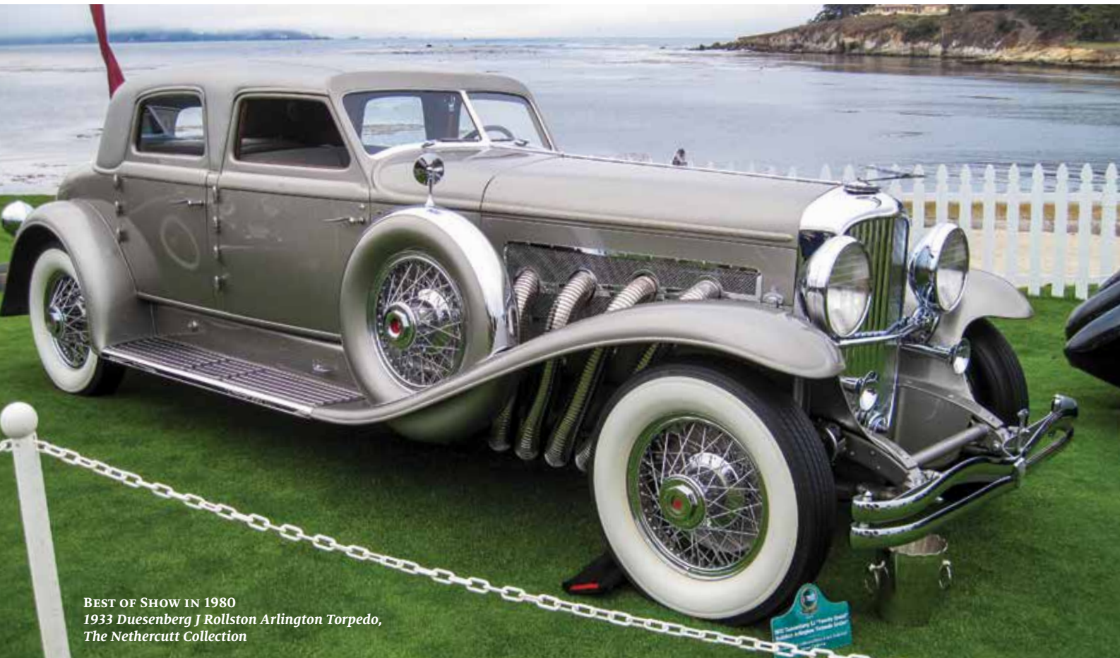
BEST OF SHOW IN 1980 1933 Duesenberg J Rollston Arlington Torpedo, The Nethercutt Collection