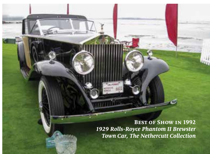
BEST OF SHOW IN 1992 1929 Rolls-Royce Phantom II Brewster Town Car, The Nethercutt Collection

An additional 69 Full Classics® filled out the field for a total of 109 CCA-recognized cars entered of the total 260 car expected, with Classic representation in 14 of the 29 classes.