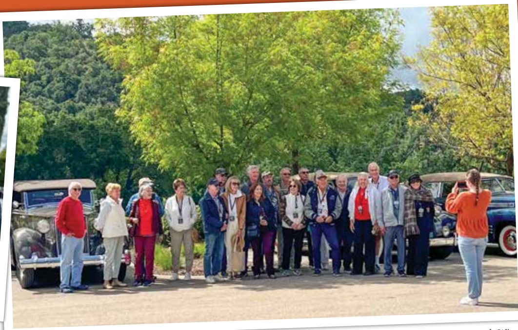
Classic Cars and Classic People at the Halter Ranch Winery