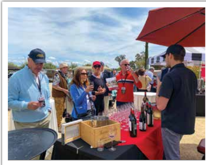
Probably the first wine tasting on a CCCA show field