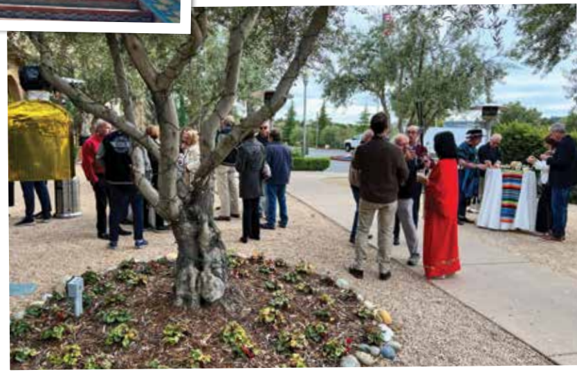
Friday's welcoming reception