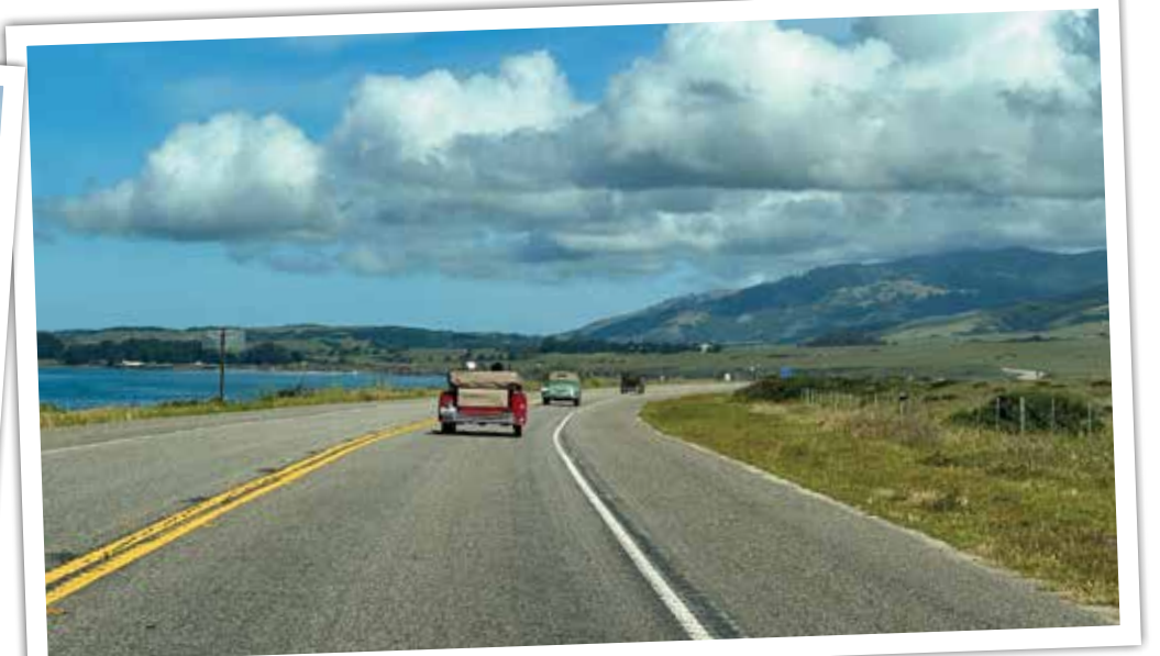
California Highway 1, the Pacific Ocean and Classic Cars