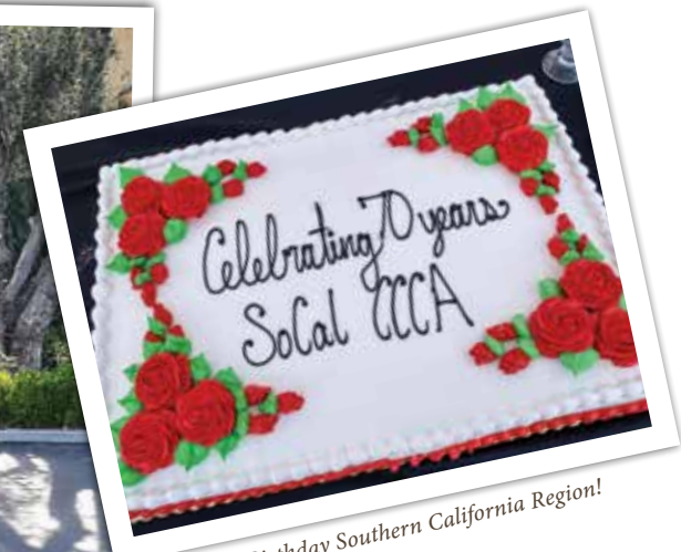
Happy Birthday Southern California Region!