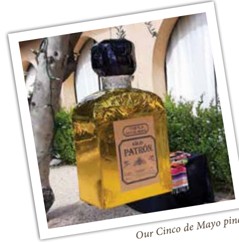
Our Cinco de Mayo pinata