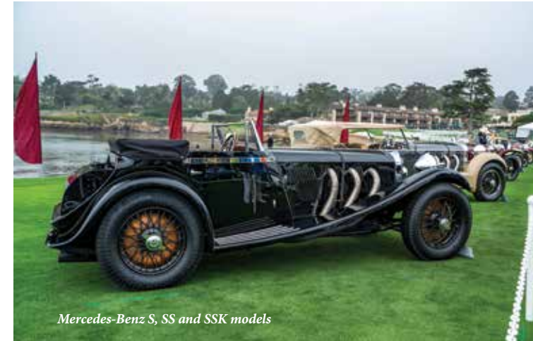
Mercedes-Benz S, SS and SSK models