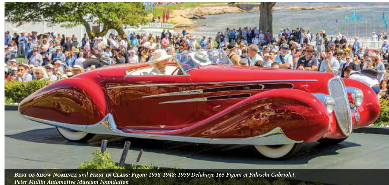
BEST OF SHOW NOMINEE and FIRST IN CLASS: Figoni 1938-1948: 1939 Delahaye 165 Figoni et Falaschi Cabriolet, Peter Mullin Automotive Museum Foundation