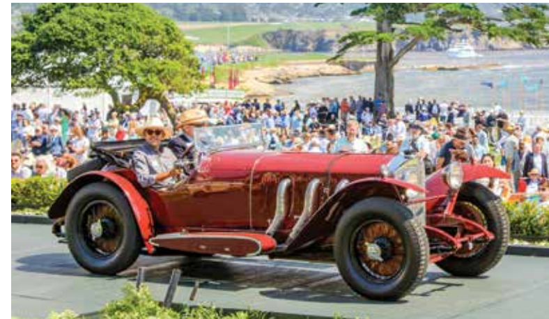
SECOND IN CLASS: Mercedes-Benz SS & SSK: 1929 Mercedes-Benz 710 SSK Barker Roadster, Miles Collier Collection at the Revs Institute