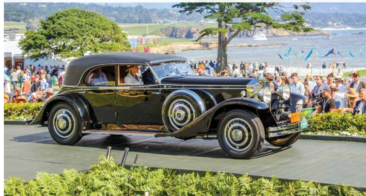
LUCIUS BEEBE TROPHY: 1933 Rolls-Royce Phantom II Brewster Special Permanent Newmarket, The Lehrman Collection