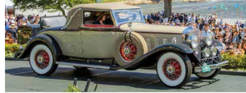
THIRD IN CLASS American Classic Open: 1931 Cadillac 452 Fleetwood Convertible Coupe, Bill & Patti Spurling