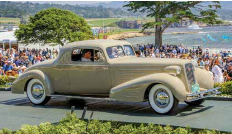
SECOND IN CLASS: American Classic Closed: 1934 Cadillac 452-D Fleetwood Coupe, Don Ghareeb