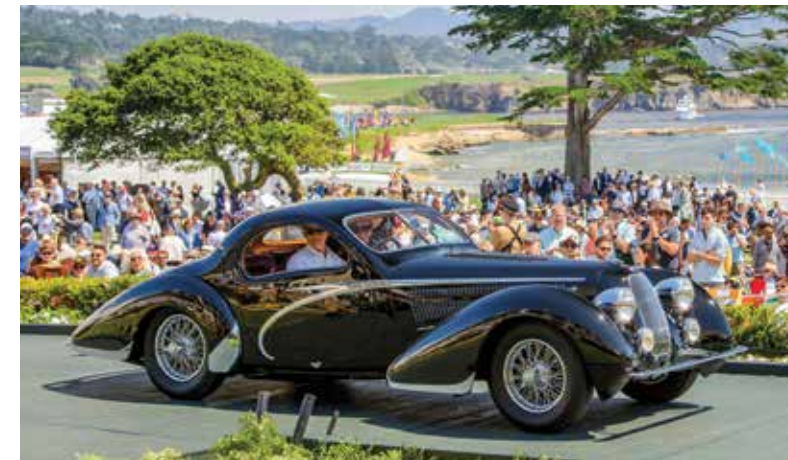
SECOND IN CLASS: Figoni 1923-1937: 1938 Talbot-Lago T150 C Figoni et Falaschi Coupe, Academy of Art University