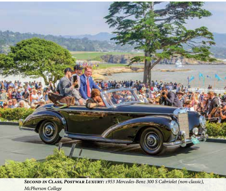
SECOND IN CLASS, POSTWAR LUXURY: 1953 Mercedes-Benz 300 S Cabriolet (non-classic), McPherson College